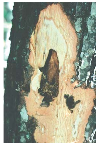
Tunnels in the inner bark indicate the presence of red oak borer.

Similarities: Moist, dark stains and fine frass may be present at sites of red oak borer attack. Differences: With red oak borer the inner bark beneath the dark stain contains a frass-packed burrow and has a discrete margin with no zone lines or evidence of canker development beyond it.