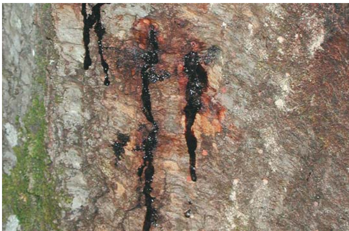
Ooze bleeds from a canker on an infected oak.

To report infected trees or to receive additional information, please contact your State or Federal forest health specialist. On the Internet, visit the SOD home page at www.suddenoakdeath.org . To distinguish this new disease from diseases with similar appearance, visit www.na.fs.fed.us/SOD .