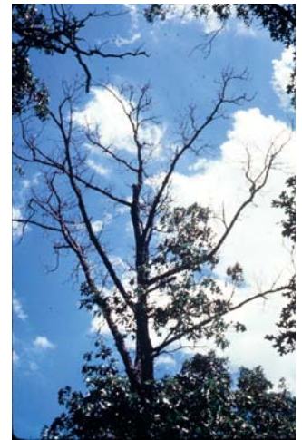
Oak decline can take years to kill an entire tree.

Similarities: Oak decline can cause death of many oaks on a landscape scale. Moist, dark stains may be present on the trunk of trees affected by oak decline. Differences: Oak decline shows evidence that dieback has occurred over several years from the top down and outside inward. Newly killed branches with twigs attached are usually found in the same crown as those in a more advanced state of deterioration killed years before. Dieback associated with sudden oak death occurs over a growing season or two. The inner bark beneath the dark stain associated with stem-boring-insect attacks has a discrete margin with no zone lines or evidence of canker development beyond the attack site.