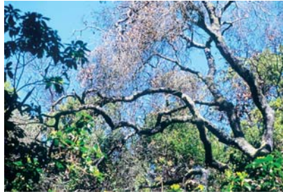
In California Phytophthora ramorum causes crown symptoms and tree mortality.

A phenomenon known as Sudden Oak Death was first reported in 1995 in central coastal California. Since then, tens of thousands of tanoaks ( Lithocarpus densiflorus ), coast live oaks ( Quercus agrifolia ), and California black oaks ( Quercus kelloggii ) have been killed by a newly identified fungus,