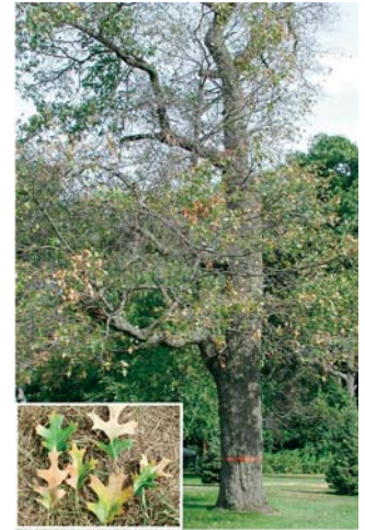
Oak wilt quickly kills most infected trees. Wilting leaves turn brown at the margins (inset) and fall as the tree dies.

Similarities: Oak wilt can also kill trees very quickly, especially if infection begins through root grafts. Differences: The oak wilt pathogen does not cause cankers on the stems, and no bleeding is associated with this disease. Dark staining may be evident under the bark of trees with oak wilt, but there are no conspicuous zone lines. Oak wilt typically causes red oak leaves to turn brown around the edges while the veins remain green. Leaves are rapidly shed as the tree dies. Conversely, in live oak with the sudden oak death pathogen, the veins first turn yellow and eventually turn brown. Leaves are often retained on the tree after it dies.